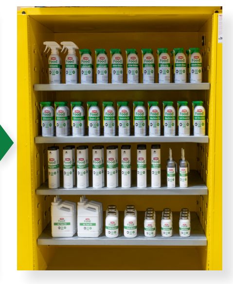
Control your cabinet with CRC StopLight®